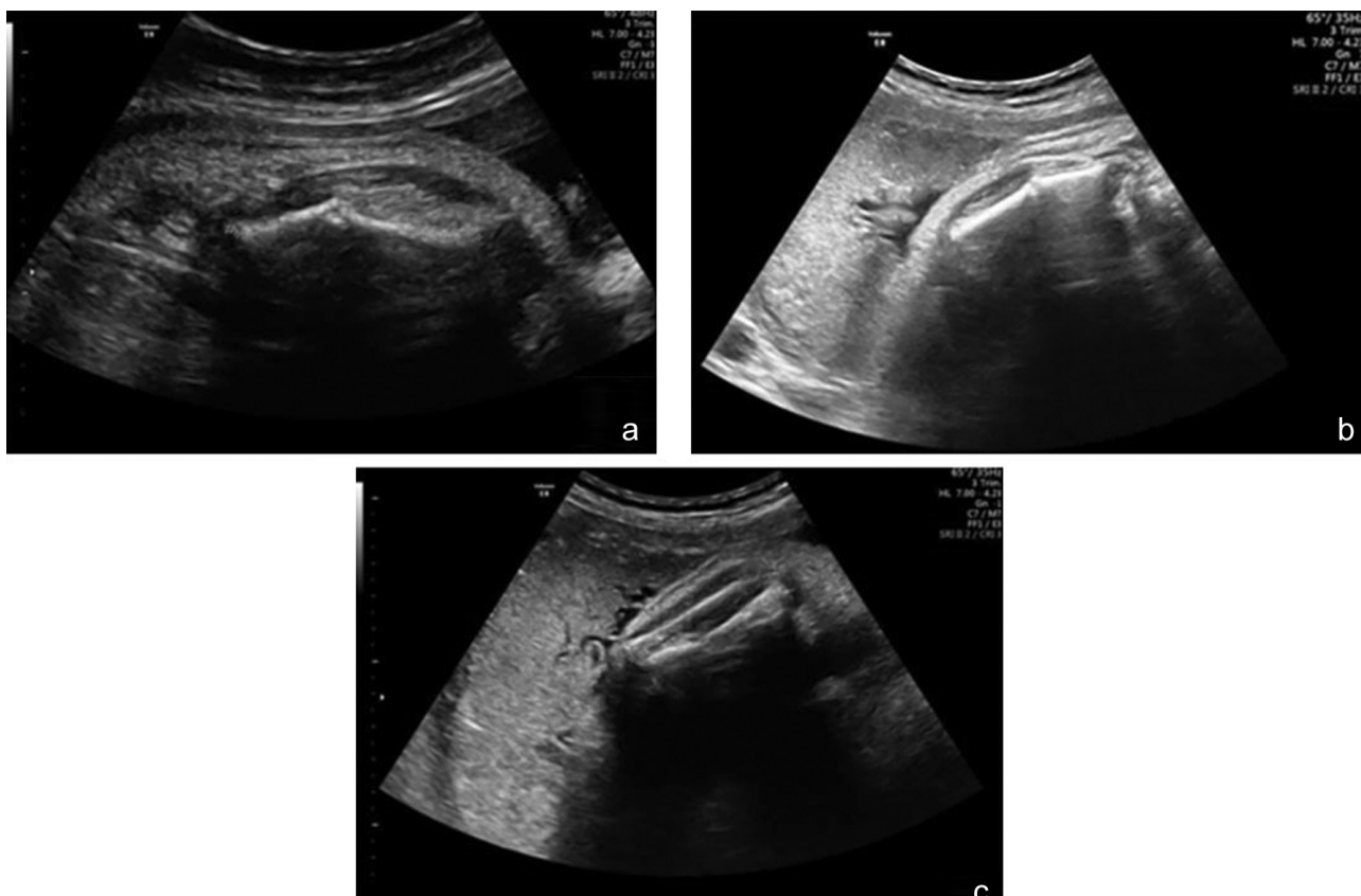
Fig. 1 Fetal ultrasound images showing in utero fractures of the right (a), left (b) femurs and left tibia (c)

No traumatic injuries were seen in the radiographs of upper limbs, clavicles and ribcage. Radiographs of lower limbs showed consolidating fractures of the right and left femurs in the middle third and transverse fracture of the right tibia in the middle third ( Fig. 2 ). General clinical, biochemical and functional examinations of the newborn were performed in dynamics including consultations from orthopaedic and trauma surgeon, endocrinologist, geneticist, neurologist and general surgeon. Clinical diagnosis made on the basis of medical history,