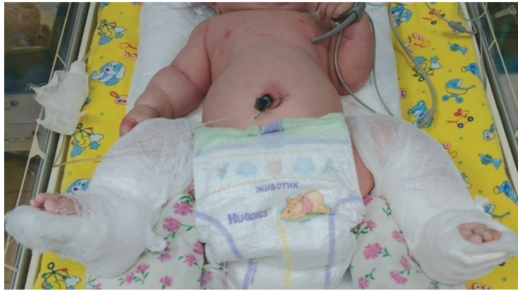
Fig. 3 Photograph of the 2-day-old baby girl showing lower limbs fixed with plaster cast

Infusion, anesthesia, antibacterial, anticoagulation and calcium-rich therapy was provided for the baby girl at the NICU. Bisphosphonates (Rezoklastin FS (zoledronic acid) at the dose of 0.05 mg/kg) were administered by interdisciplinary team's decision. Neither arterial blood pressure measurement with the cuff nor baby weighing were performed to prevent acute bone fractures of upper limbs. The baby girl