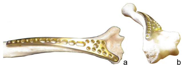
Fig. 1 Posterior distal combined plate attached to artificial humerus showing (a) back view; (b) view from the elbow joint

Posterior distal combined plate intended for fixation of the fractures and nonunions in the lower third humerus was developed at the RVSRITO within the context of governmental research assignments (Patent № 163085 dtd 10.10.16). The fixator ( Fig. 1 ) is manufactured by Russian company «DC» and a component of a kit of figurate plates approved for clinical usage.